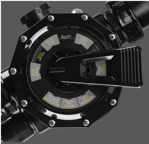
7-position multi-port valve for 2" plumbing (SFTM24-2.0)